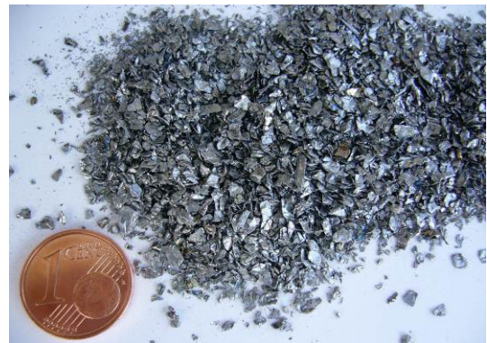
Fig. 3: Comminution with the PULVERISETTE 19 and 2mm sieve

Ensuing is an additional fine comminution to a finer powder possible without any problems with the Universal Cutting Mill PULVERISETTE 19. Excellent results are available for example also for the fine comminution of aluminium-alloys from the manufacturing of car engines. However, care then has to be taken, because fine metal powders are prone to self-ignition. In the present case with the chosen fineness, for additional applications a suitable powder is prepared.