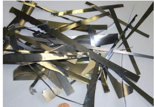
Fig. 2: Sheeted vanadium for sample preparation

The shown foils were thin enough to be cut directly with the Universal Cutting Mill PULVERISETTE 19 . Cutting tools made of hardmetal tungsten carbide and a sieve with a 2 mm trapezoidal perforation were utilized. Due to the high rotational speed of the Cutting Mill PULVERISETTE 19 a high fine fraction is of course obtained.